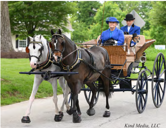
Kind Media, LLC

To be eligible, horses must have been entered, shown and judged in class 398.